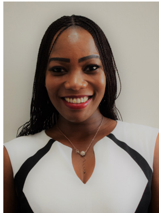
SELEPE R.L HR CLERK HR PLANNING & SYSTEM-HEAD OFFICE