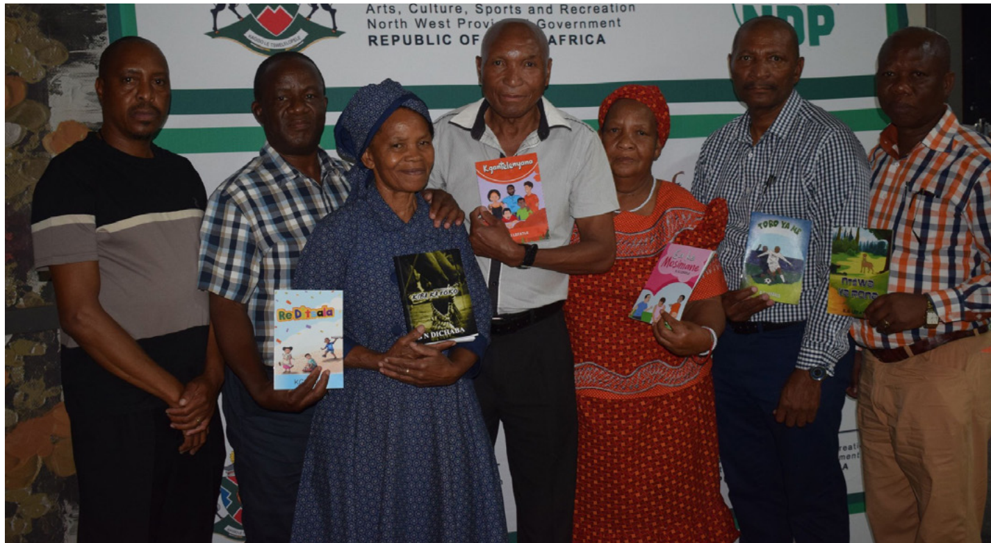
Group photo book launch.

A tswelala le yunibesiti ya UNISA. Kwa teng o bone gerata ya gagwe ya borutabana ka 2001. O ikwadisitse le yunibesiti ya Rand Afrikaans mme a bona lekwalo la teng ka ngwaga wa