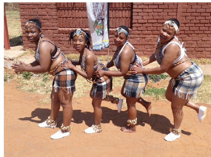
Top: Batlotli ba ngwao cultural group

The Outreach to communities serves also as a platform to market our services.