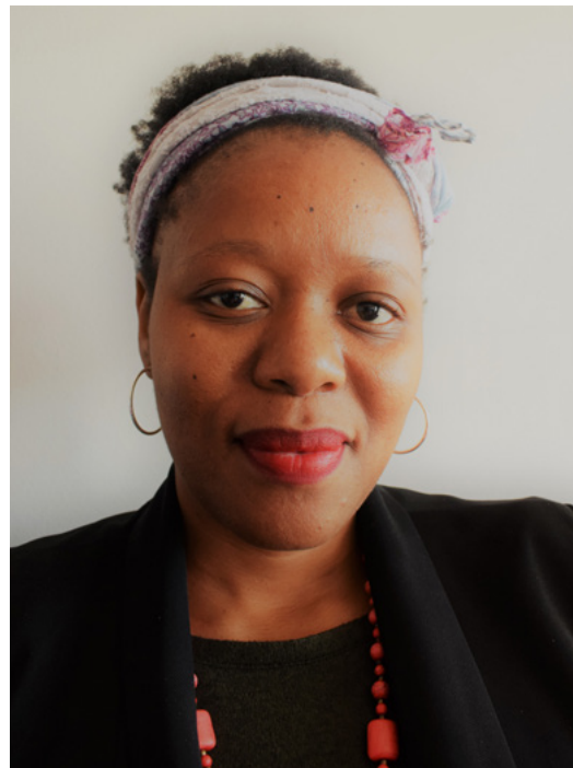
MOKOROANE T.P ADVOCATE HEAD OFFICE