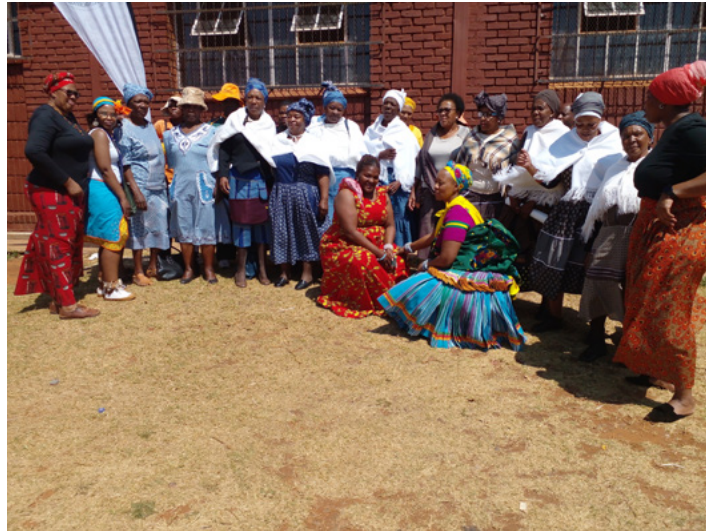
women celebrated Literacy and Heritage day

Living heritage is the foundation of all communities and an essential source of identity and continuity. In every community there are living human treasures who possess a high