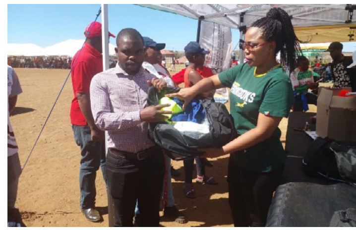
Swartruggens intermediate secondary