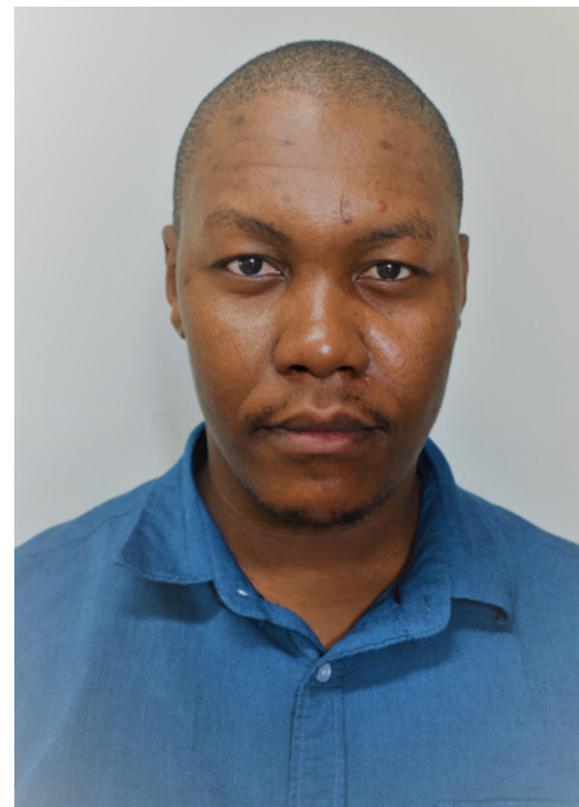
SECHOGO O SUPPLY CHAIN CLERK HEAD OFFICE