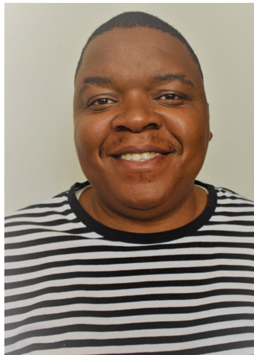
HABANA L.B SUPPLY CHAIN CLERK HEAD OFFICE