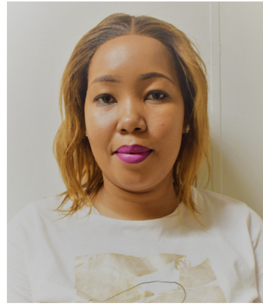
TAU K.K SUPPLY CHAIN CLERK HEAD OFFICE