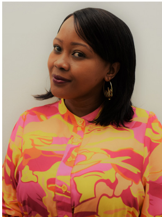
MOLUSI N HOD PA HEAD OFFICE