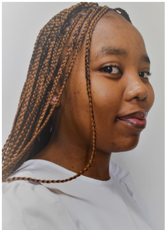
MOLOSIWA V SUPPLY CHAIN CLERK HEAD OFFICE