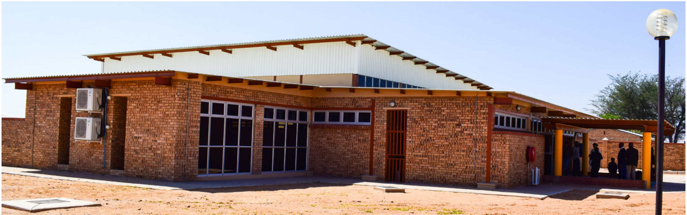
The external view of the newly opened library, Southey Community Library.

Continuing in its quest to encourage a culture of reading and writing as a lasting legacy in the formally disadvantaged communities, the North West Department of Arts, Culture, Sports and Recreation (ACSR) officially handed over two libraries to the community members of Tlapeng and Southey Villages in Kagisano Molopo Local Municipality.