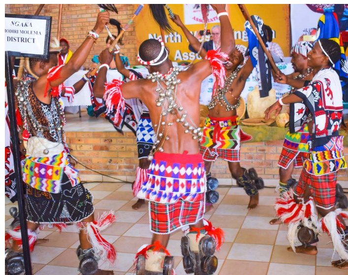
Dingaka in full swing during the annual conference.