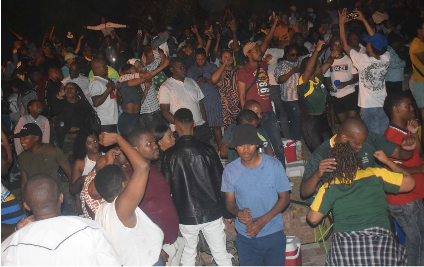
RUGBY VIBE: Part of the crowd at the Mafikeng Fan Park where Acsr sponsored a public viewing of the Rugby World Cup Final