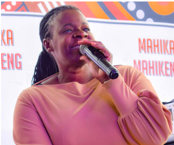
Judith Sephuma