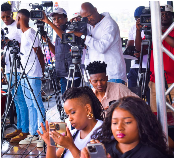
Media at Mahika launch

The Amapiano night will feature genre heavyweights such as Kabza De Small, DJ Maphorisa, Tira, Big Zulu and Kwesta.