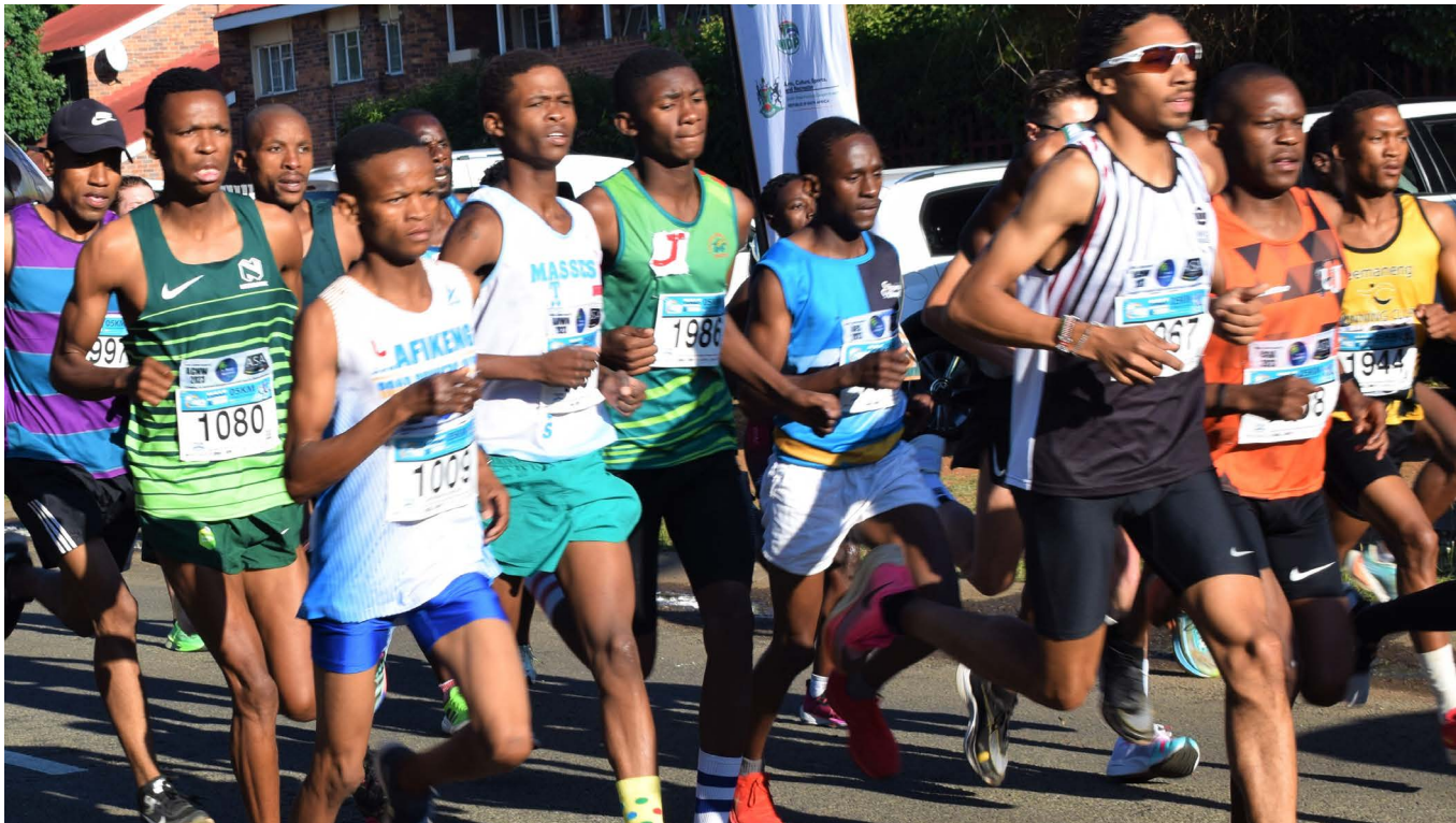
Athletes as they start their 21Km race at N12 Marathon in Potchefstroom